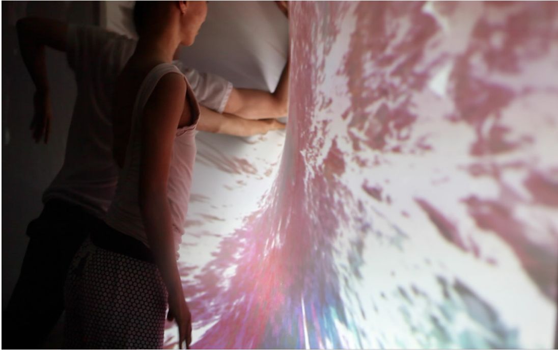
2017 Aug. Popup! -Mizaru- Ellenville Farmers Market, NY, USA