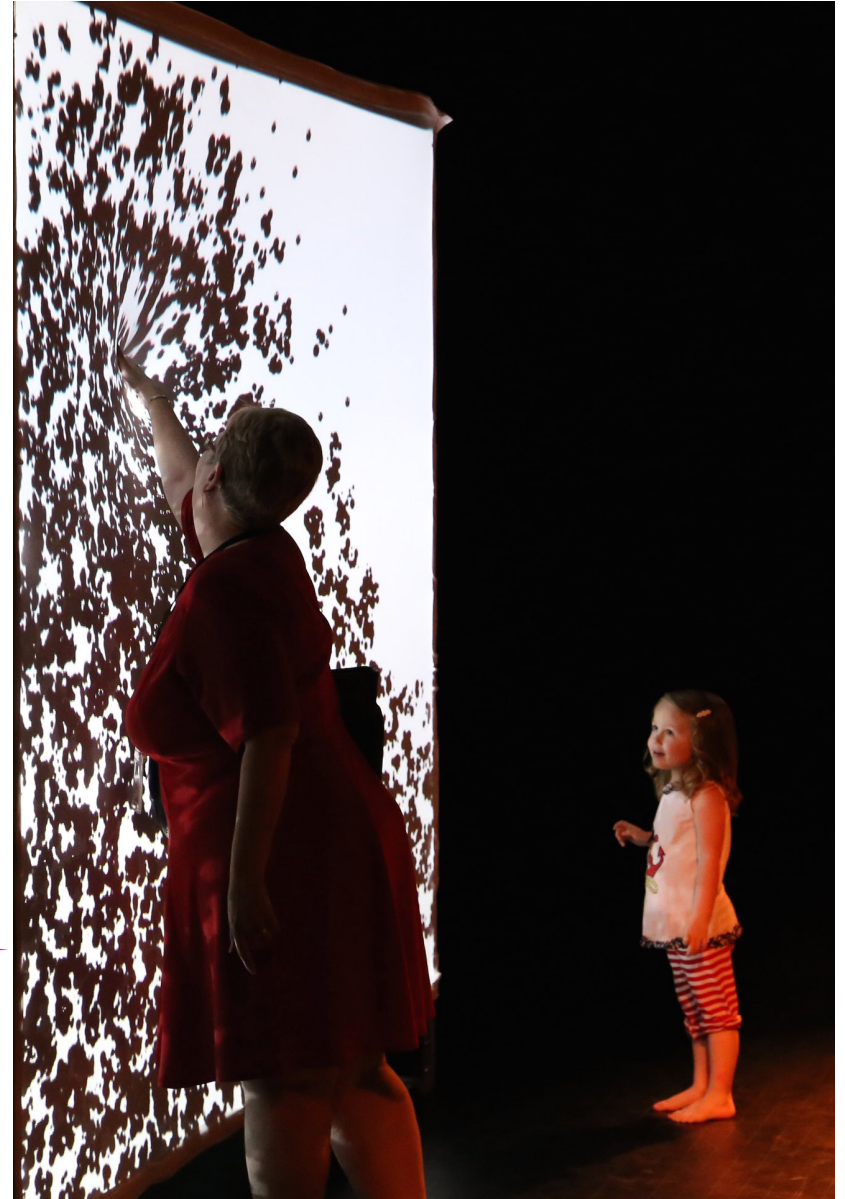
2018 Feb. MIZARU installation Toronto International Film Festival, Canada